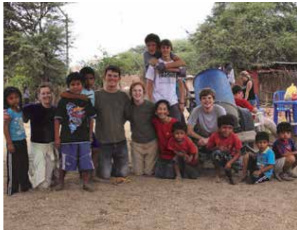
Pictured above are students and chaperones who went on the 2012 Youth Mission Trip to Piura, Peru.